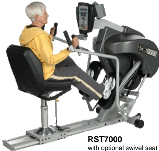
RST7000 with optional swivel seat

SCIFIT introduces the RST7000 Total Body Recumbent Stepper. We have taken our unique idea of “walk up, sit down, and get a great workout” to the next level. The large, comfortable seat makes getting on and off the RST7000 a breeze. One touch start and contact heart rate make exercising and monitoring your workout easy. SCIFIT's unique isokinetic resistance program, ISO-Strength, allows you to get a great cardio and strength workout in one machine.