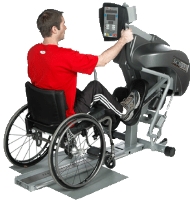
The RST7000 is wheel chair accessible and ADA compliant.