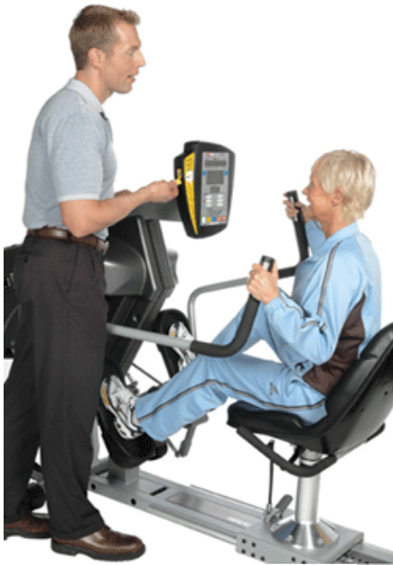
The RST7000 is perfect in therapy settings.